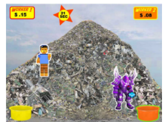
Above: previous participants of a Usernomics workshop. Below: a sample hacked video game entitled "Great Race for E-Waste."